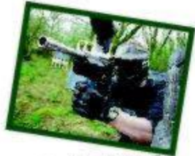
Paintball at Lost Canyon