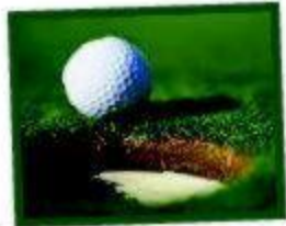
Golf in Williams